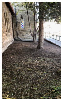
Scenes from the cleanup