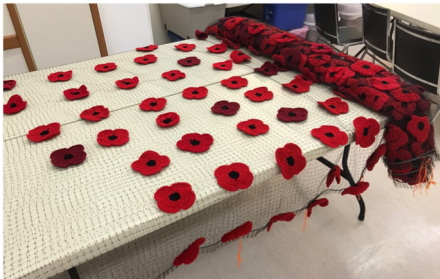
A work in progress.

Your help is requested in attaching poppies to the netting. If you can help, there is a work bee in the church hall every Thursday morning from 10:00-12:00.